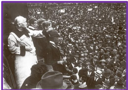
Clara Zetkin and women liberation